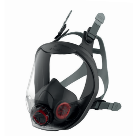
FORCE™ 10 SMALL (MASK ONLY) Force™ 10 respirator: EN136