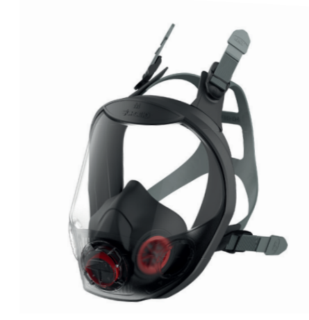
FORCE™ 10 MEDIUM (MASK ONLY) Force™ 10 respirator: EN136