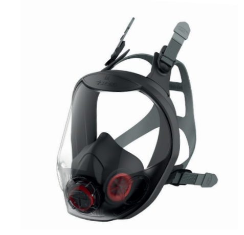
FORCE™ 10 LARGE (MASK ONLY) Force™ 10 respirator: EN136