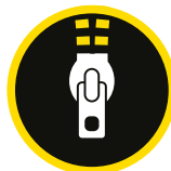
YKK MAIN ZIP LIFE TIME WARRANTY