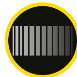
PART ELASTICATED WAIST