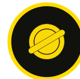
NON-SCRATCH HEAVY DUTY FIXING STUD