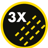
TRIPLE STITCHED SEAMS